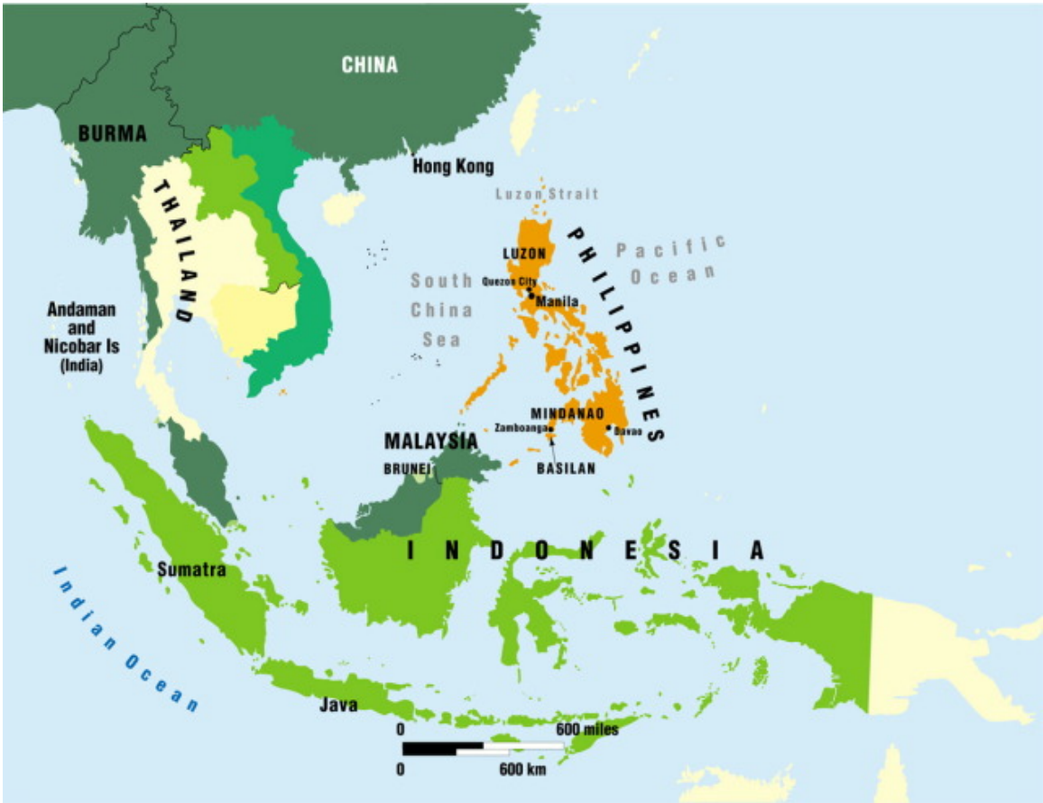
Map 2. The Philippines.