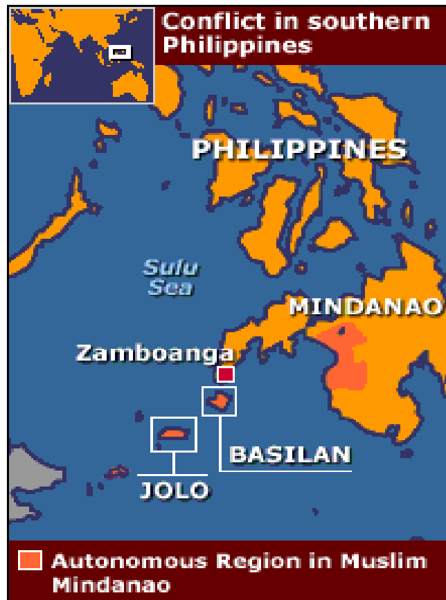
Map 3. Autonomous Region in Muslim Mindanao.