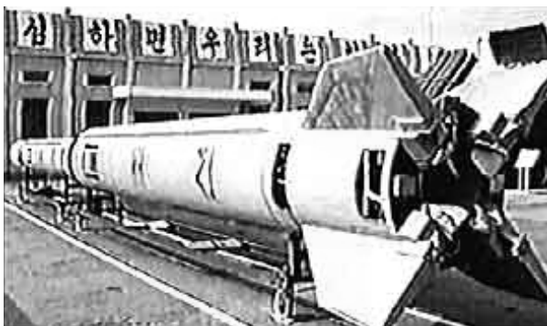
A North Korean Taepo-Dong missile

North Korea has an extensive ballistic missiles programme and sells goods and technology relating to this programme to other countries of concern. North Korea has also frequently been accused of not completely having abandoned the idea of a nuclear weapons programme, despite its agreement 2 with the US on that subject, signed in 1994. North Korea tested a medium-range missile in 1998. By the end of 2002, North Korea openly admitted to have pursued the possession of nuclear weapons, and early 2003 the country announced its decision to withdraw from the Nuclear Non-Proliferation Treaty. By now the country has restarted one of its nuclear reactors that were closed under the 1994 treaty.