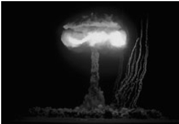
Nuclear explosion

In order to produce nuclear weapons (nuclear explosion weapons) it is necessary to have plutonium or highly enriched (weapons-grade) uranium. These fissionable materials are not freely available on the international market. They can only be produced through complicated separation processes, for example in a nuclear reactor or ultracentrifuge system. So if a country or organisation wishes to develop a nuclear weapons programme, it needs nuclear projects for the production of the required fissionable material. Civilian nuclear projects, like nuclear energy projects, usually do not require plutonium or highly enriched uranium.