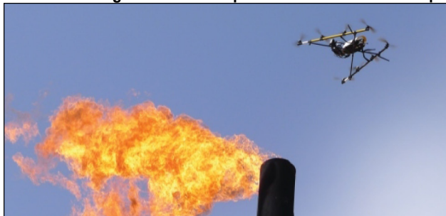
Flare stack inspection