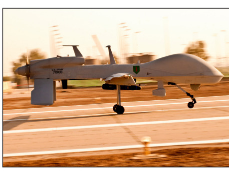
Army Gray Eagle