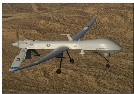
Figure 1: The Air Force's MQ-1 (Predator), the Army's MQ-1C, (Gray Eagle), the Air Force's RQ-4 (Global Hawk) and the Navy's MQ-4C (Triton)

Force's Predator and the Army's Gray Eagle and acknowledged similarities between the Air Force's Global Hawk and the Navy's Triton (see Fig. 1).