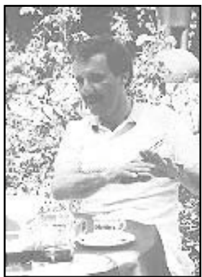
Edward Lee Howard

Edward Lee Howard, former CIA officer, was reportedly forced to resign in June 1983 after failing a