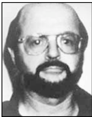
John Walker, charged by a Federal grand jury in Baltimore, Maryland on six counts of espionage.

John Walker Jr. was raised in Scranton, Pennsylvania. He had an unhappy childhood with alcoholic and separated parents. Walker left high school while in the 11th grade and on 25 October 1955, he joined the US Navy. While serving in the Navy, Walker was considered highly competent and in the first half of his 21 years of active duty, he rose from the seaman grade to warrant officer. He also earned the Navy equivalency