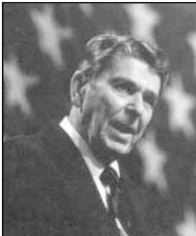
President Ronald Reagan

(b) Committees. The NSC shall establish such committees as may be necessary to carry out its functions and responsibilities under this Order. The