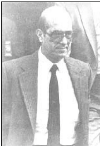
Arthur James Walker

Whitworth was secretly married in 1976. Between that year and 1985, Whitworth met with Walker on an average of two to four times a year at which time he would pass to Walker 25 to 50 rolls of Minox film containing classified information. Whitworth was originally paid $2,000 per month for the material he