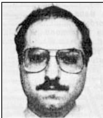
Jonathan Jay Pollard

According to the Israelis, at their first meeting with Pollard, he identified himself as a civilian Navy intelligence officer and produced his ID card and his courier authorization. He said he wanted to give the Israelis certain information that was being withheld from them by the United States. At the first meeting, Pollard did not provide any classified information but did at a subsequent meeting. At a meeting in Paris, Pollard was introduced to his new handler, Rafael Eitan, who agreed to pay Pollard $1,500 each month.