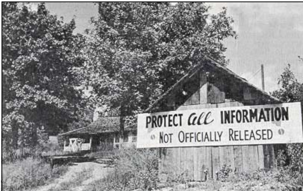
Security sign at the Tennessee site.

The appointment of special agents was a move towards greater formalization of the procedure for dealing with espionage, which continued to increase as the project grew in size and scope. Another constructive measure was the establishment of a group of permanent surveillance squads to carry out supplemental and nonroutine personnel investi-