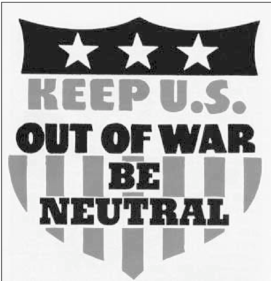
Poster used by isolationists to maintain the US policy of neutrality at the beginning of World War II.

instances, prompt action by the Office of Censorship led to withdrawal of the articles before they had received wide circulation. Subsequent action by the War Department resulted in tracing down the sources of the leaks and in implementing improved security measures to prevent such occurrences in the future. 212