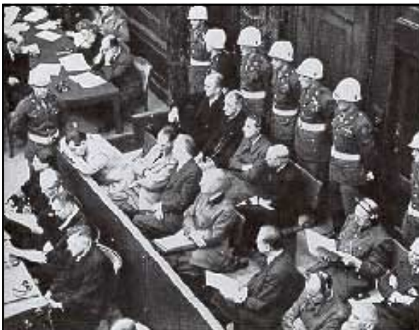
CIC arrested thousands of Nazis after the allied occupation of Germany. In this photo, German leaders are being tried at Nuremberg.

Investigations of military personnel suspected of disaffection, espionage, treason, sedition, sabotage, or of violations of AR 380-5, "Safeguarding Military Information," were reported on War Department Form CIR 1 (Counter Intelligence Report No. 1). This form contained a summarization by the investigating agent,