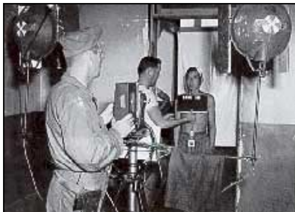
CIC photographed captured spies for identification purposes.

(b) Coordination of the procurement and shipment of Counter Intelligence Corps units.