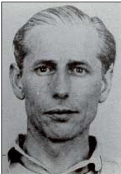
George John Dasch