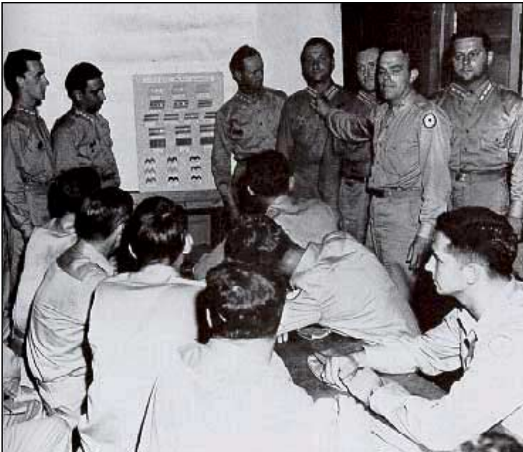
CIC trainees in a class to learn to identify Japanese insignia rank in 1942.

During the years 1942-1943, agents of the Counter Intelligence Corps made thousands of loyalty investigations on military personnel and civilians assigned to duties requiring access to classified material. The transfer of certain investigative functions from the Military Intelligence Division to the Provost Marshal General in October, 1941, did not relieve the Corps of the duty of investigating personnel already in military service who were working with classified material. Typical examples