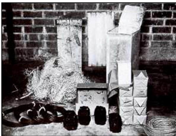
Equipment buried by the German saboteurs who landed in Florida on June 17, 1942.

Each group of saboteurs brought with them to the United States four waterproof cases containing a large