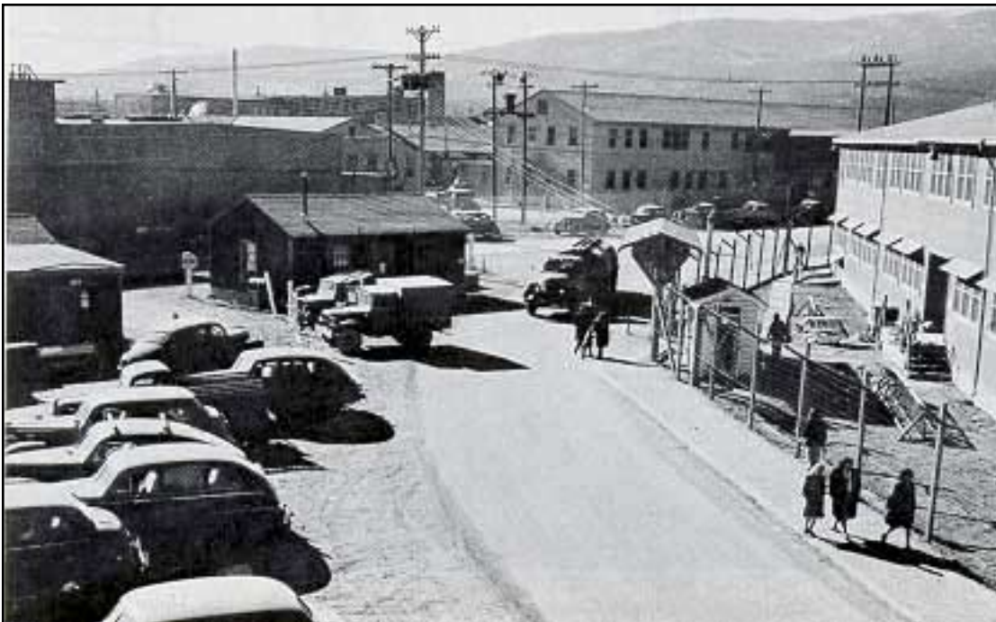
Street Scene in Los Alamos. The barbed wire fence separates the technical installations from the residential area.

The modest OSRD security system sufficed until, in the spring of 1942, the start of the uranium program's rapid expansion—the letting of numerous contracts with industrial firms; the employment and interaction of ultimately tens of thousands of workers, scientists, and engineers; and the formation of complex organizations to construct and operate the large-scale production plants and their atomic communities—enormously complicated the problems of security just at the time the Army undertook its new role as project administrator. Although