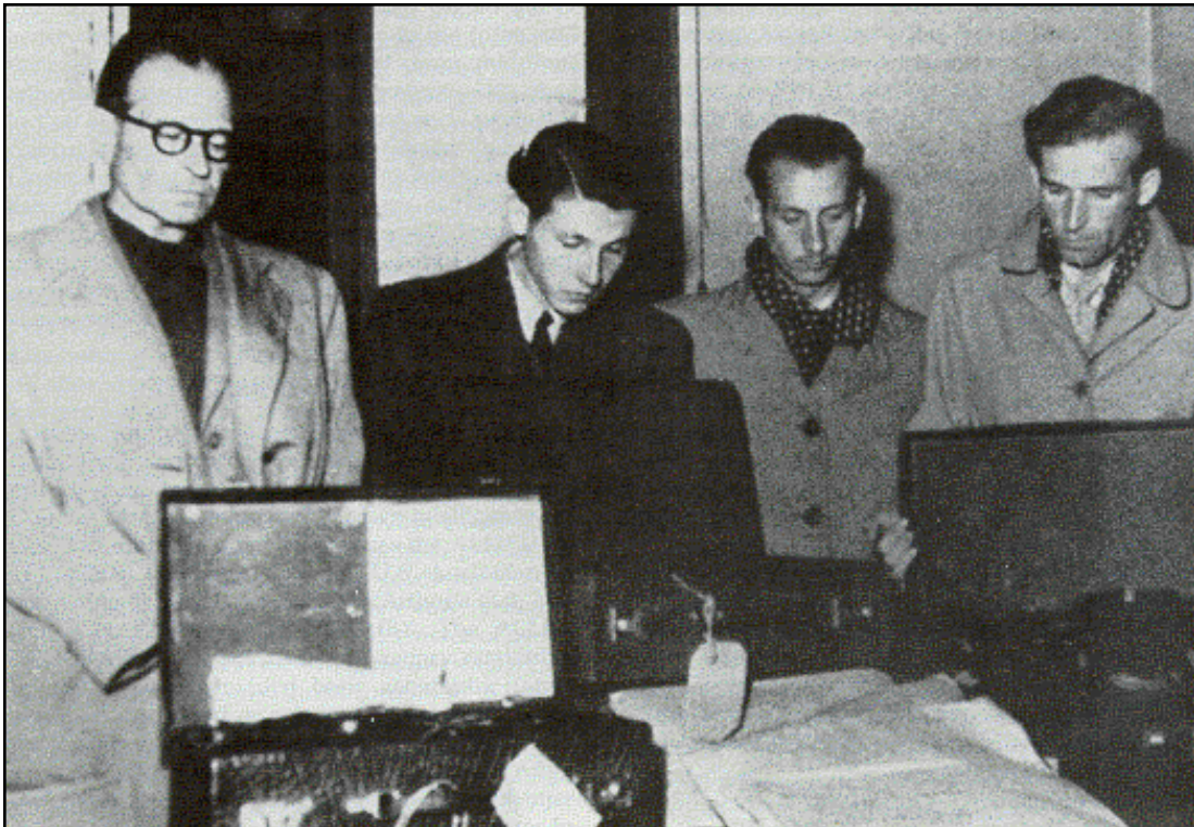
German Agents with their radio equipment captured by the Army Counter Intelligence Corps in France during the second World War.

In April 1943, it was determined that since all Counter Intelligence Corps personnel were chargeable to War Department overhead, they should be assigned to the War Department and attached to the various service commands for administrative