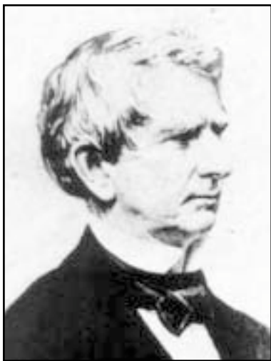
William H. Seward

There are no informative records as to how or why the initial arrests of political prisoners and the creation