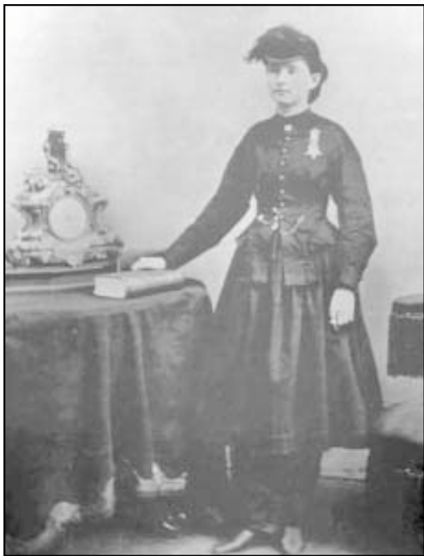
Mary E. Walker, Winner of the Medal of Honor, who worked for Lafayette Baker.

For three years, Baker gathered intelligence on the enemies of the Union, reporting his findings to Stanton and Lincoln. In addition, at their direction and sometimes on his own authority, he functioned as an instrument for directly punishing the enemy or for arresting and incarcerating them. Utilizing his intelligence sources, Baker identified and prejudged the despoilers of the Union; relying upon extraordinary military authority and martial law, he seized his foe in his capacity as a Federal policeman; and as the custodian of the Old Capitol Prison and its nefarious annex, the Carroll Prison, he served as jailer of those he captured.