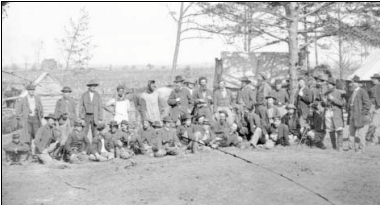
Members of the Bureau of Military Information, Army of the Potomac.