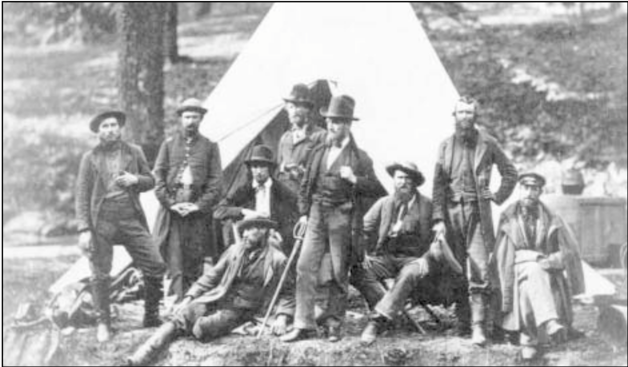
A group of Union Spies.