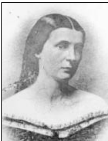
Rose O’Neil Greenhow

She was arrested on 21 August 1861 by Allan Pinkerton, chief of the Secret Service on the staff of General McClellan, at the instigation of President Abraham Lincoln. She was first imprisoned in her own home at 16th and H Streets, NW (where the