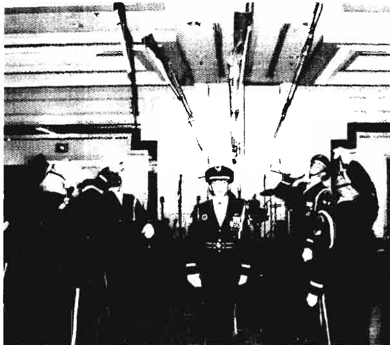
The USAF Honor Guard performing the 4-Man Drill requiring immense precision and concentration

can also be immensely rewarding. We need strong and committed men and women in government who put the Nation's interest above self-interest and who put patriotism above profit."