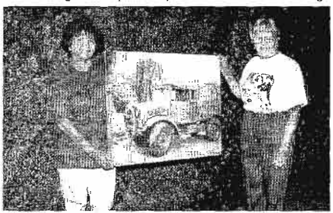
who donated their NSA Blood Donor Program, pose with photo of an original M.A.S.H.

Throughout the day, episodes of the popular television series were projected on the walls to entertain those caring Agency employees who donated their NSA blood. The turnout wnit.