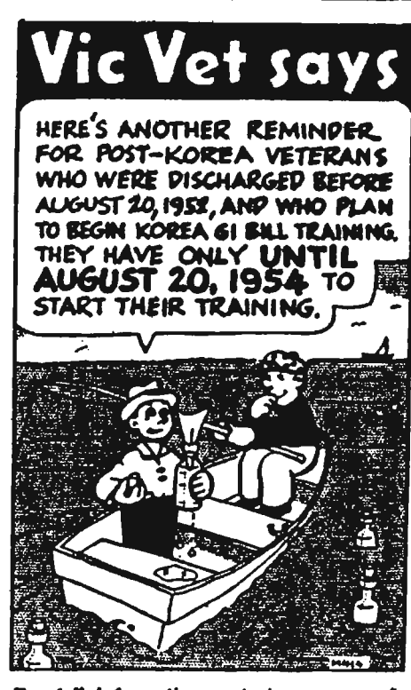
For full information contact your meares VETERANS ADMINISTRATION office