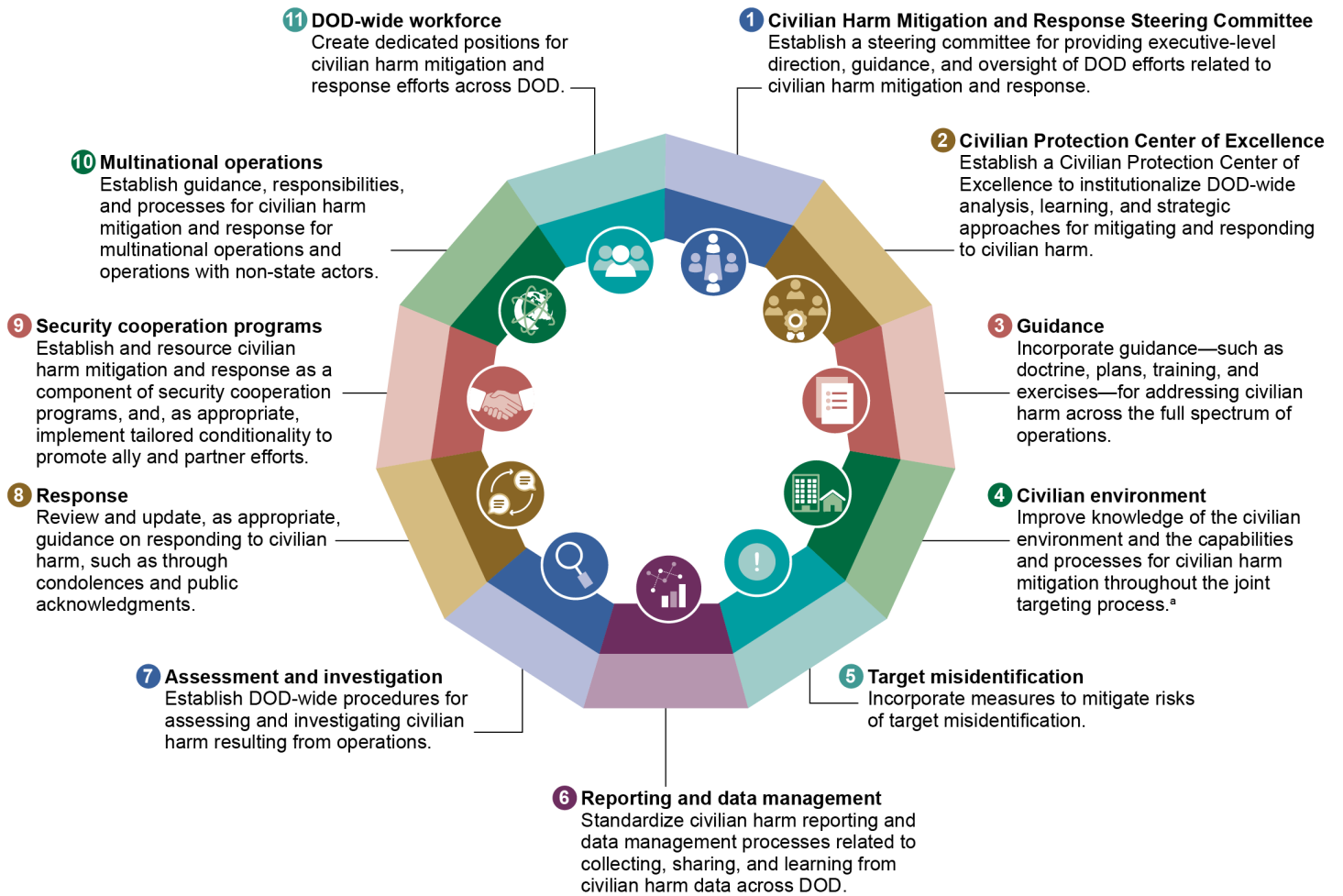
Figure 1: 11 Objectives Outlined in the Civilian Harm Mitigation and Response Action Plan