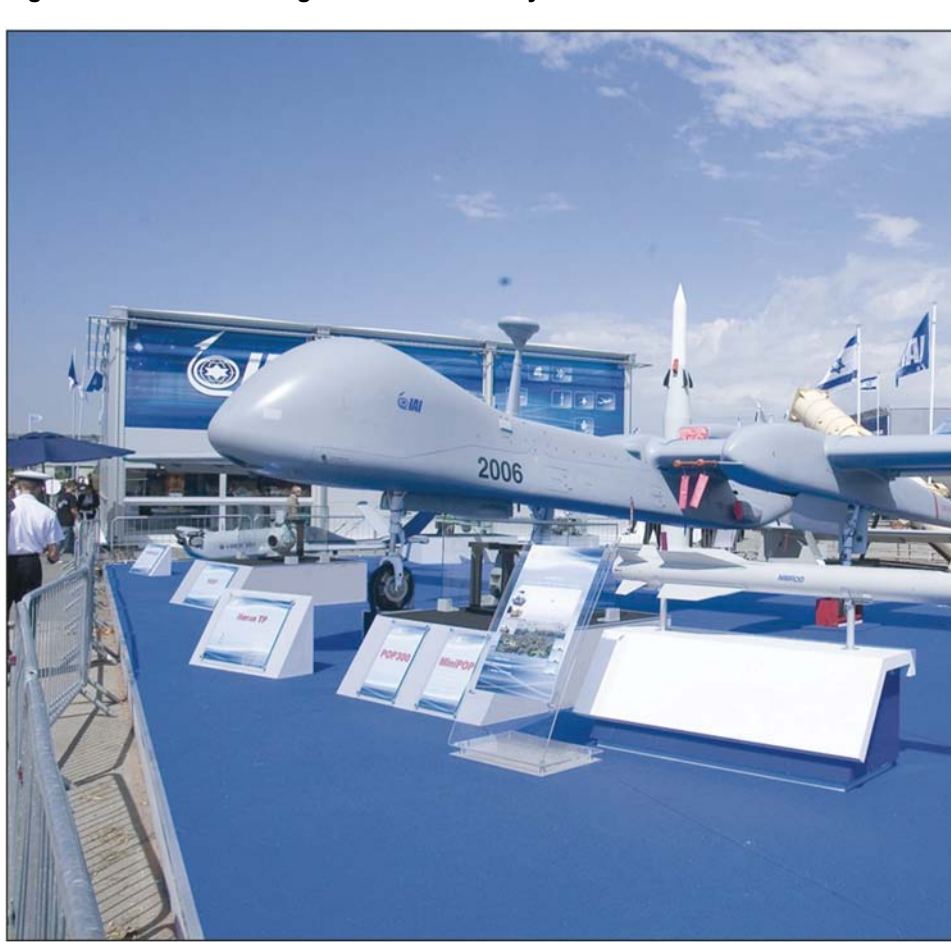
Figure 4: Heron TP-Strategic UAV Produced by an Israeli Manufacturer

According to Israeli UAV manufacturers, exports are critical to their UAV programs as they account for the majority of revenue from the production of a system. Israel exports both mini and tactical UAVs. In addition, Israel has exported the Heron I, which is a strategic UAV. Company officials at an Israeli manufacturer told us they are currently marketing the Heron TP, a strategic UAV that would fall under Category I of the MTCR (see fig. 4). Because Israel has made several changes to its export control regime since 2006 and is one of the three countries that we visited, we provide further details about the changes that Israel has made to its export control regime since 2006 in appendix III.