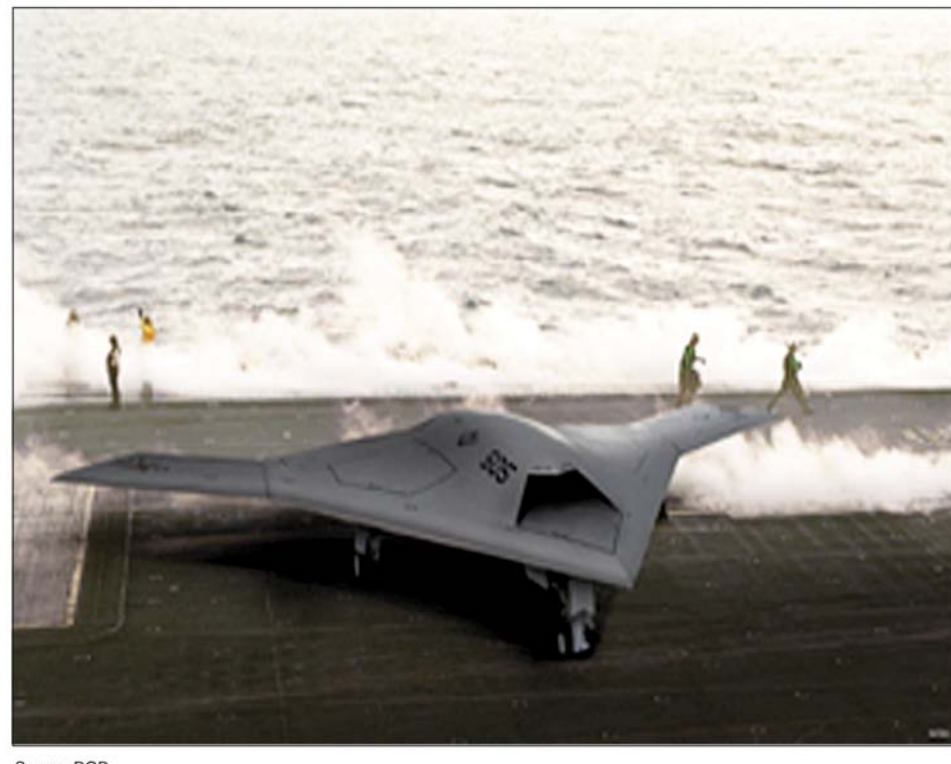
Figure 5: Northrop Grumman's X-47B UCAV