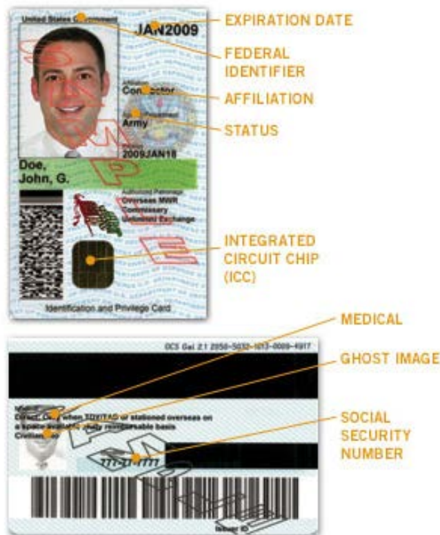
Figure 3. U.S. DoD and/or Uniformed Services ID and Privilege Card

c. U.S. DoD and/or Uniformed Services ID and Privilege Card . The CAC shall be issued according to Reference (s). This card shall be the primary ID card granting applicable benefits and privileges for civilian employees, contractors, and foreign national military, as well as other eligible personnel in the following categories: