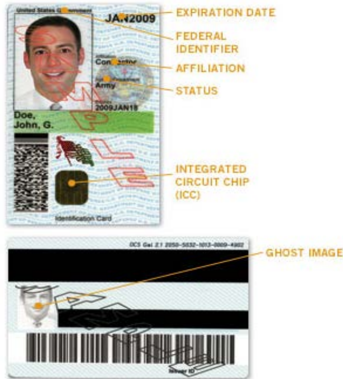
Figure 4. U.S. DoD/Uniformed Services ID Card

d. U.S. DoD/Uniformed Services ID Card . This CAC shall be the primary ID card for eligible civilian employees, contractors, and foreign national affiliates that do not receive the identification and privilege CAC.