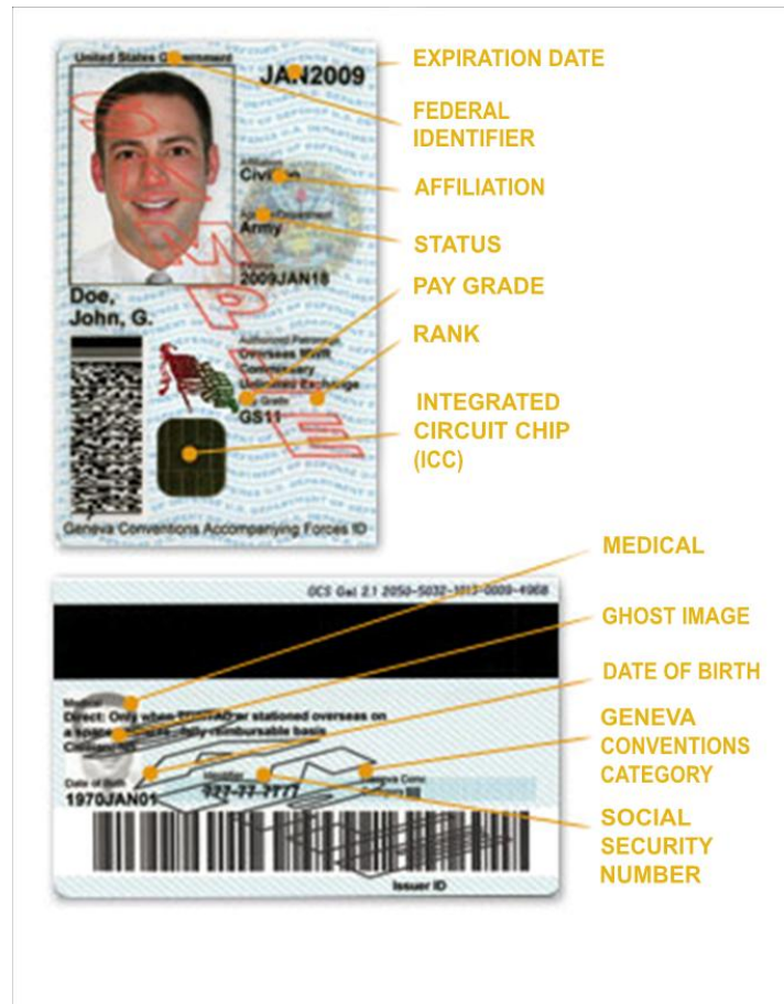
Figure 2. U.S. DoD/Uniformed Services Geneva Conventions ID Card for Civilians Accompanying the Armed Forces

b. U.S. DoD/Uniformed Services Geneva Conventions ID Card for Civilians Accompanying the Armed Forces . The CAC serves as the U.S. DoD and/or Uniformed Services Geneva Conventions identification card for civilians accompanying the Armed Forces and shall be issued according to Reference (v).