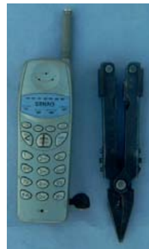
Cell Phone RC Unit