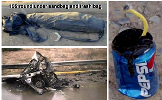
155 round under sandbag and trash bag