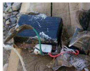
RC Unit from Car Alarm