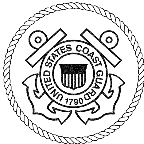
Figure E-1. Illustrations of military emblems