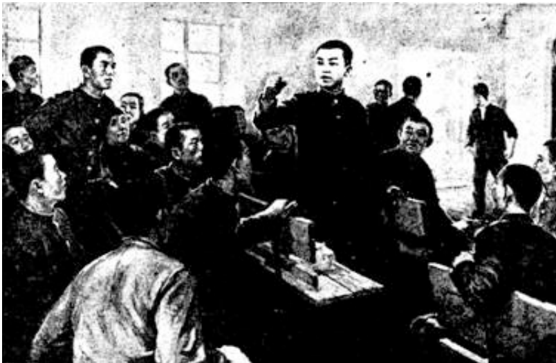
Image used by the North Korean regime in 1968 to justify the eventual designation of a young Kim Jong Il as successor. The painting, carried by the party daily Rodong Sinmun, shows Kim Il Sung in his youth organizing resistance fighters during the Japanese occupation of Korea.

While Kim Jong Il's stroke last year may have accelerated the timeline for the actual naming of a successor, it appears that Kim has been planning and preparing for the move since at least 2001. The correlation between shifts in succession propaganda and the portrayed influence of certain regime officials suggests that the issue has been a source of political jockeying in the intervening years. It also is likely that these internal dynamics are influencing regime decisions on a number of fronts, including foreign policy.