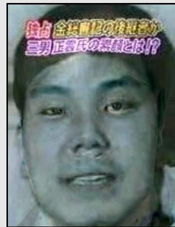
Only known photo of Kim Cho'ng-un, reportedly taken when he was 10 (top) and an OSC-generated age-progression photo of what Kim may look like now at 26 (bottom).

This OSC product is based exclusively on the content and behavior of selected media and has not been coordinated with other US Government components.