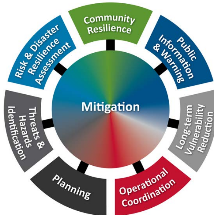
Figure 4: Mitigation Core Capabilities

There are three capabilities that cross all five mission areas: Planning, Public Information and Warning, and Operational Coordination. These capabilities are shared and provide direct linkages among the mission areas.