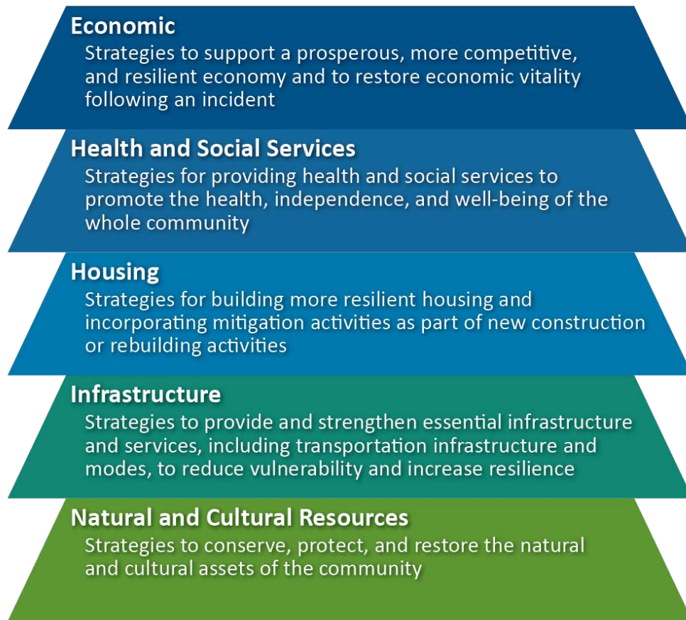
Figure 3: Comprehensive Mitigation Includes Strategies for All Community Systems

Comprehensive mitigation strategies consider the systems that make up communities and the Nation. Mitigation activities are implemented through the core capabilities with consideration given to the economy, housing, health and social services, infrastructure, and natural and cultural resources (shown in Figure 3). 10