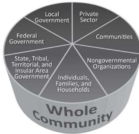
Figure 2: Composition of the Whole Community

capabilities—making these investments an increasingly effective, cost-efficient, and sustainable approach for the whole community to build resilience.